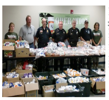
Drug Take-Back Event

To dispose of prescription and over-the-counter drugs, call your city or county government's household trash and recycling service and ask if a drug take-back program is available in your community. Some counties hold household hazardous waste collection days, where prescription and over-the-counter drugs are accepted at a central location for proper disposal.